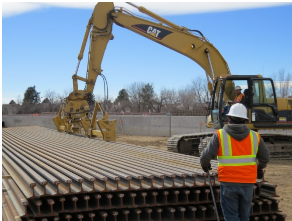
Workers stack a rail shipment for installation along the I-225 Rail Line in Aurora.

The FasTracks Citizens Advisory Committee or CAC will hold its next quarterly public outreach meeting in Aurora next month and will focus on the Aurora Line/I-225 Rail project.