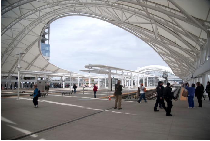
Visitors walk beneath the new Train Hall canopy behind historic Denver Union Station.

The Union Station Transit Center project – one of the world’s most exciting new transit hubs – is being recognized by industry peers.